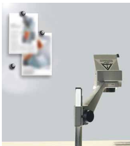
Projection surface, magnetic, grey Code: HP 8219