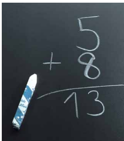
Magnetic surface suitable for writing on with chalk, black Code: HP 8205