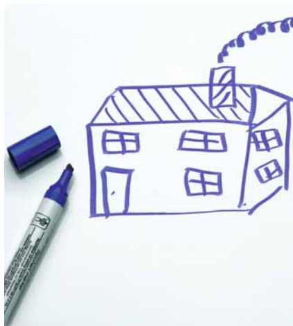
Magnetic suitable for writing on with marker pens, white Code: HP 8206