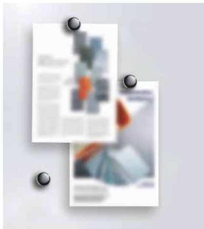
Magnetic suitable for writing on with marker pens, grey Code: HP 8208