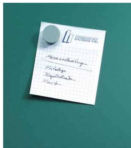
Magnetic surface suitable for writing on with chalk, green Code: HP 8211